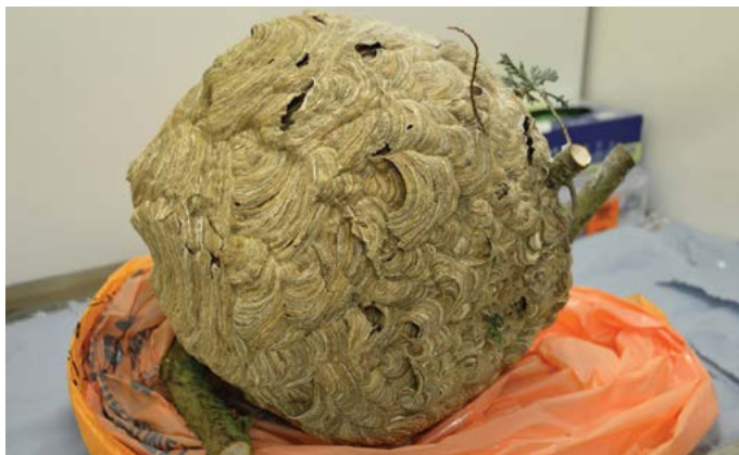
Asian hornet nest found in September 2016 on arrival at Fera