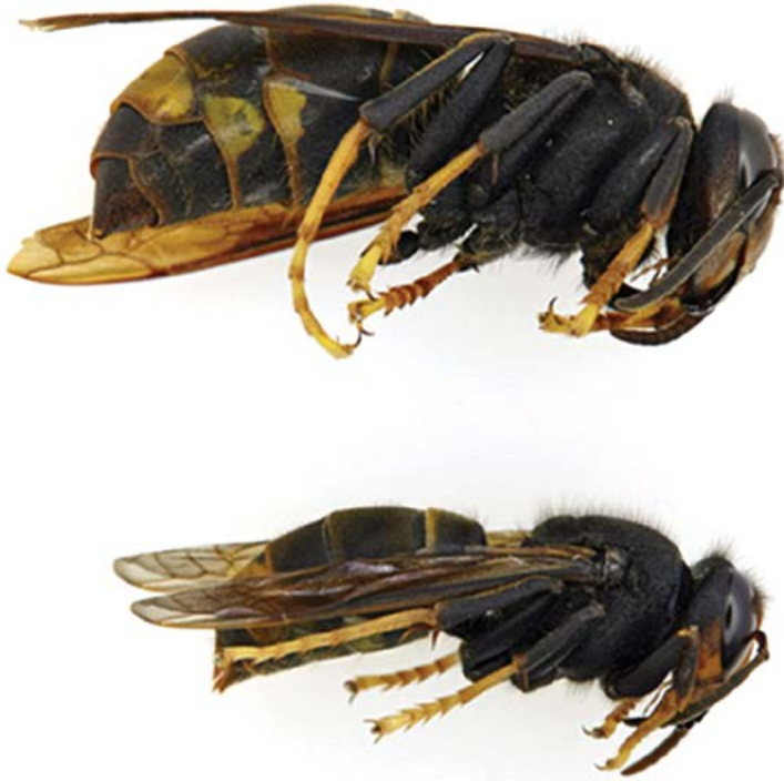
The difference in size between an Asian hornet queen (above) and worker (below)

The nest was approximately 35 cm in diameter and was found to contain five combs ranging in diameter from 7.5 to 23 cm. All life stages of the hornet (eggs, larvae, pupae and adults) were found in the nest. In total, across the five combs, there were 2,359 cells. Based on the diameter of the largest comb and using a formula described in Rome et al (2015), the total number of hornets produced by the nest was approximately 2,889.