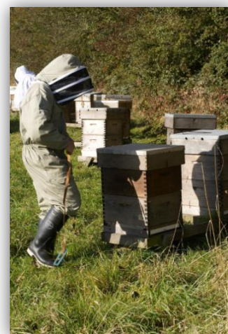
Fera is an Executive Agency of Defra

BeeBase is an important tool in the control of bee diseases and pests. Where pests are confirmed, the NBU can use BeeBase to identify apiaries at risk in the local area and as a result target control measures effectively. By knowing where the bees are, we can help you manage disease risks in your apiaries. Such risks could include the incursion of new pests eg. small hive beetle.