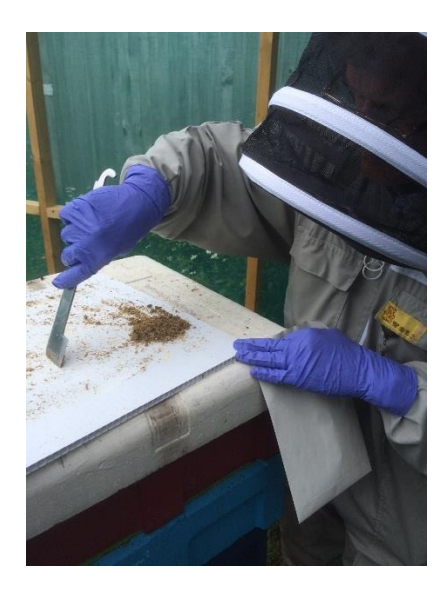
SBI collecting hive debris for analysis during an ESA visit