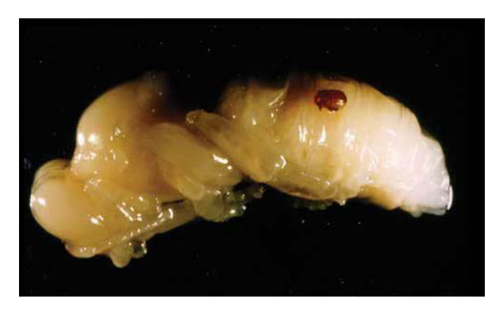
Tropilaelaps Mite on Pupa

hive beetle (SHB), tropilaelaps mites and Asian hornets (AH) as well as being a normal brood inspection looking for foulbrood. The identified risk points are ports, airports, crude hive product importers, fruit and vegetable wholesale markets, larger queen importers and landfill sites associated with imported products. Given the continued presence of SHB in Italy in 2018, and the incursion of the Asian hornet from across the channel in France, the importance of exotic pest surveillance work cannot be overstated.