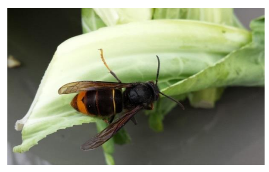
The Bury 'cauliflower' Asian hornet queen

In April an individual Asian hornet found in a cauliflower by a householder in their kitchen in Bury, Lancashire. The cauliflower had been grown in Lincolnshire but it is thought that it may have been stored with vegetables from France. No further confirmed sightings have been recorded in the area despite extensive surveillance and trap setting. Whether this particular queen survived to establish a nest and produce future generations is unknown, as is whether other queens were imported via the same movement of produce. This incident confirms a viable produce transit route for Asian hornet into our area, so please remain vigilant.