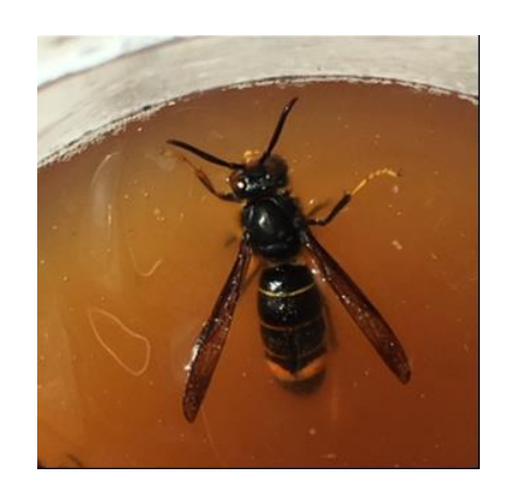
Asian hornet Vespa velutina - Fowey

Meanwhile back in Fowey, all was quiet following destruction of the nest on September 6th until a week later when a few additional hornets were caught in traps in the same area. Suspicions were aroused that these were more than stragglers from the first nest. Within two days a second nest was located in woodland adjacent to the first, and on 20th September 2018 it was also destroyed. It should be emphasised that although close to the first nest, the terrain was extremely difficult to carry out surveillance and the second nest could only be seen in the tree from one viewing position at the bottom. Analysis shows that the two nests in Fowey were primary and secondary nests from the same queen.