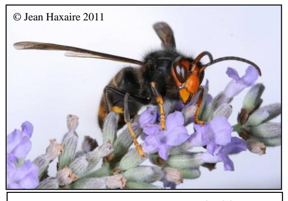
Asian hornet, Vespa velutina nigrithorax

incursion of this exotic insect and will be much surprised if it is not confirmed in the coming season.