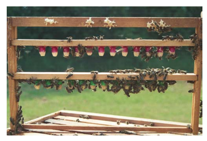
Figure 2. A frame of newly accepted queen cell grafts.

ease. Two or three large queenright rearer colonies are selected, according to their size and temperament, each having the equivalent of at least 20 full deep combs of bees, 8 to 12 combs of healthy brood of all stages, and the equivalent of two or three full combs of pollen. These sizes relate to British Standard frames (356 x 216mm) which are about 75% of the area of Langstroth frames. Large colonies over-wintered on a double brood-box system have often been the most suitable.