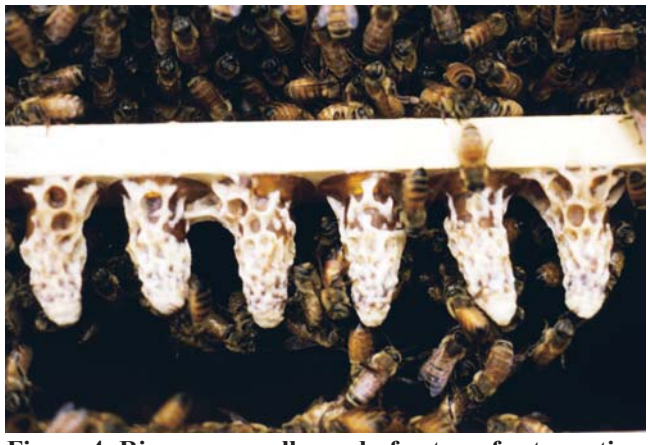
Figure 4. Ripe queen cells ready for transfer to mating nucs.