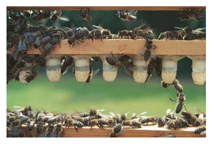
Figure 3. Newly accepted queen cell grafts - each larva is very well fed, floating on a deep bed of milky-white royal jelly visible through the clear plastic queen cup.

Eight to 24 hours after set-up, the graft frame is removed, and young larvae are collected from a breeder colony, brushing the bees off the frames rather than shaking to avoid dislodging the larvae. Grafting has been successful whether done inside or outside,