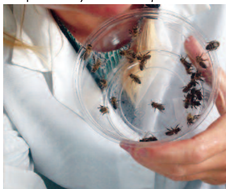
Newly emerged worker bees in the lab.

In other insect hosts closely related symbionts are often vertically transmitted via eggs, but horizontal transmission of Arsenophonus from the environment or other insects is also possible. Based on our preliminary tests Arsenophonus