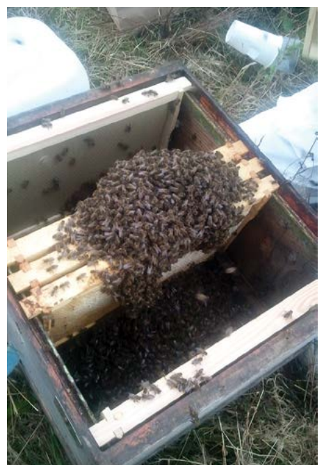
Checking packaged bees and decanting them into hives

to meet these requirements but a detailed list can be found in the Commission Regulation (EU) 206/2010