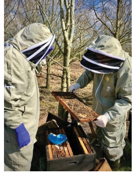
A National Bee Unit training session

provided to train beekeepers at both an intermediate and advanced level, and to support the needs of both experienced and prospective bee farmers.