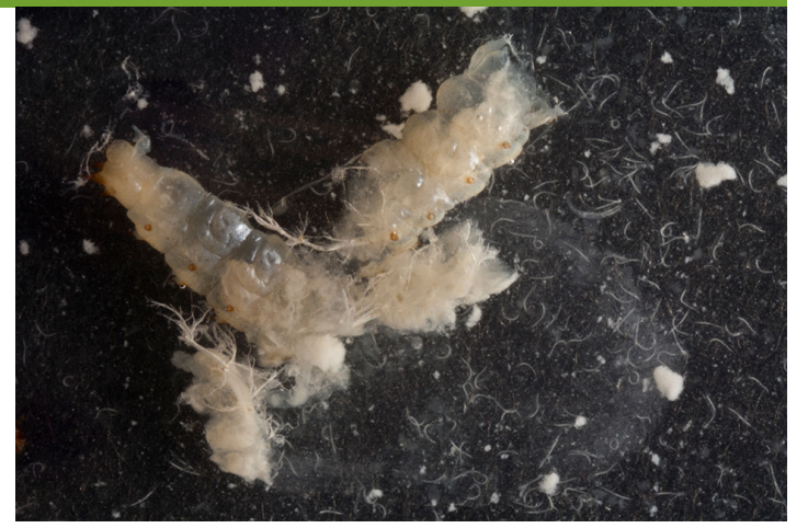
Figure 3. Dissected Aethina tumida larvae releasing the entomopathogenic nematode Steinernema carpocapsae

the larvae entering the sand. Assessment of the pupation medium following the trials in which nematodes had been applied three weeks after the larvae had entered the sand produced semi-formed adult beetles that had been infected and killed by the nematodes (Figure 4).