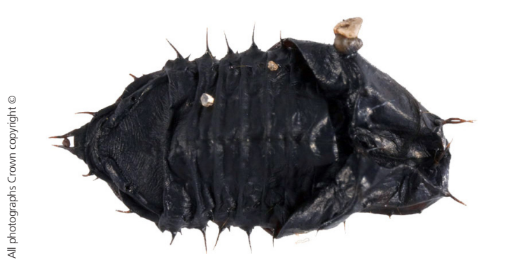
Figure 4. Developing small hive beetle killed by nematodes applied to sand three weeks after the larvae had entered the sand to pupate

Delayed application of the nematodes demonstrated that S. carpocapsae could offer a good level of control of the pupating small hive beetle larvae up to three weeks following