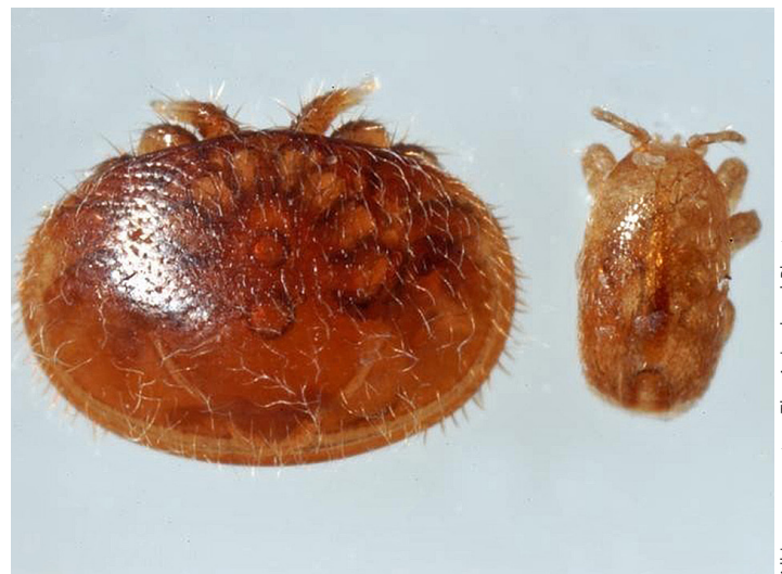
Figure 1. A comparison of Varroa destructor (left) and Tropilaelaps

bees through parasitization is similar to that caused by varroa, for example, reduced bee weight, deformations and mortality. Severe infestations left untreated can, and do, kill honey bee colonies.