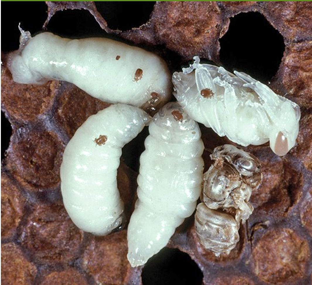
Figure 2. Tropilaelaps mites on bee brood at different stages in the life cycle

successful than varroa in Korea 6 . This may be explained in part by the different climates – Thailand is tropical while Korea is temperate and may experience broodless periods in winter 6 . Either way, it is not good news for beekeepers or their bees.