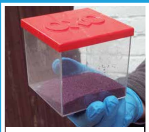
A decanted banned pesticide