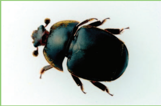
Small hive beetle