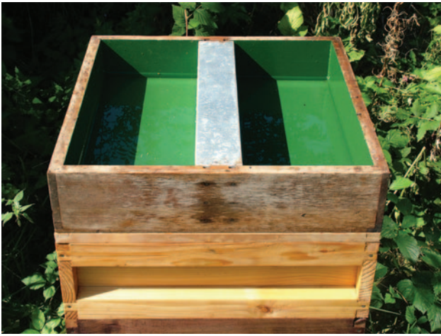
A rapid feeder. Bees access the syrup through a central slot and this type of feeder can be easily topped up with minimal disturbance to the bees.

A full brood frame holds approximately 2kg and a super frame holds 1kg, so it is easy to assess a colony's stores during an inspection. It is best to avoid feeding colonies from which you expect to take a honey crop unless absolutely necessary, as feeding during the season can lead to honey crops becoming contaminated with syrup.