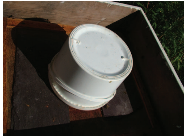
A contact feeder filled with syrup and inverted over the hole in a crown board. This is a container (here, a bucket) with a tight-fitting lid either containing a section of fine mesh or pierced with small holes through which the bees access the syrup.

container with a tight-fitting lid can be used. Feeding can be slower when using a contact feeder and changes in temperature and air pressure can cause syrup to leak from the container onto the bees. A super or brood box is also needed to house the contact feeder.