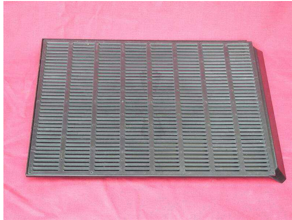
Figure 4, the West plastic floor tray.