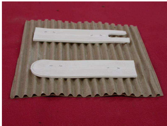
Figure 2, a simple, corrugated trap used for lowering SHB populations within the colony.

In the USA the varroacide 'CheckMite+' is used to control Small hive beetle. Should this pest be confirmed in the UK, it is most probable that this product will be used for control, initially by means of a Special Treatment Authorisation. At the time of writing this product is not approved for any use in the UK (updated March 2014) but can be applied for under Cascade. A single strip is cut in half and stapled to a square of corrugated material. This square is placed strip-side down onto the floor of the hive so that when beetles burrow under the ridges they contact the strip. Beekeepers in North America report that this treatment is insufficient to control beetles if used alone. The treatment period is six weeks. It must not be carried out with supers on the hive and these cannot be placed on the hive for at least two weeks after removal. Strips of corrugated plastic that bees don't chew are available.